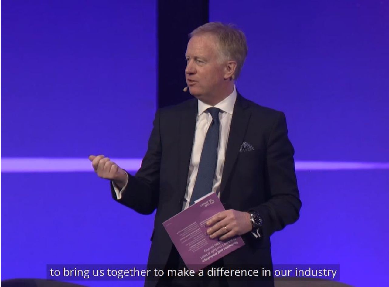
to bring us together to make a difference in our industry