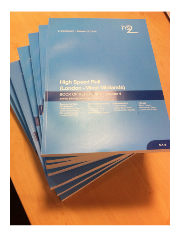
Figure 3. The book of reference – over 2500 pages long

had been changed to permit deposit in electronic format, during the debate in parliament on the changes, the transport minister had promised that locations wishing to receive hard copies relevant to their area could request this. A significant exercise was therefore carried out to contact every deposit