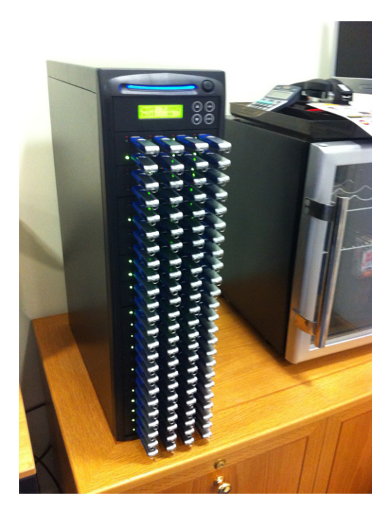
Figure 5. Production of digital copies of the bill

location, establish their requirements for electronic or hard copy and also to establish their requirements for delivery (some parishes were located in people's homes).