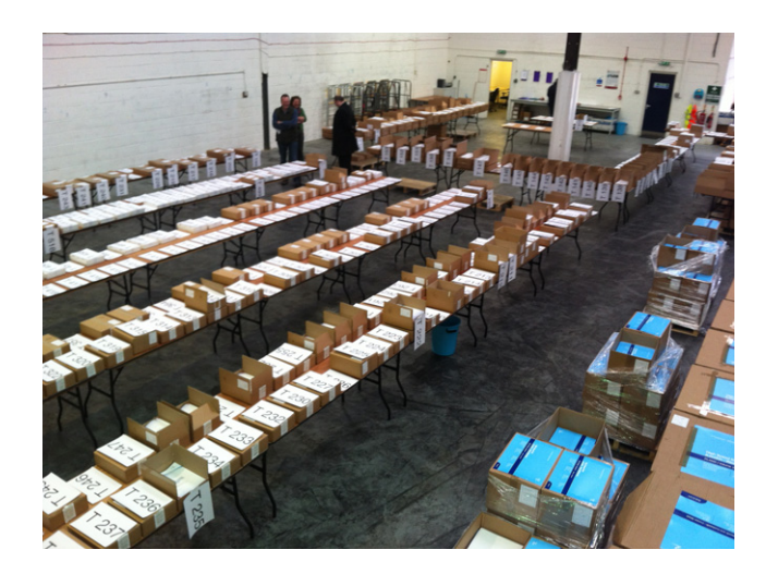
Figure 6. Assembly of copies of the bill for distribution

A key benefit of promoting a scheme through parliament is the ability to amend the scheme during the course of select