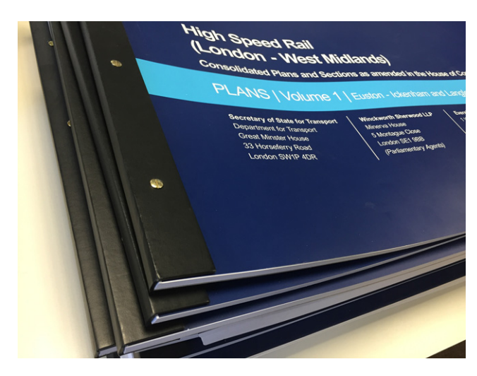
Figure 2. Plans and sections – nearly 700 A1 sheets in 11 volumes

Standing orders required deposit of the bill at approximately 250 locations along the route, including parish councils, libraries, council offices and others. Although standing orders