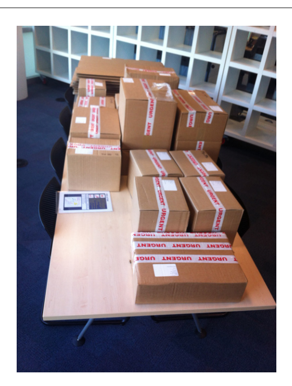
Figure 4. One copy of the bill